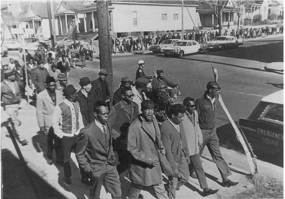
FIG. 1. Strikers and their supporters protesting in March 1968.

calls for manhood were also calls for respect of human dignity of all black Memphians, both women and men. But in another sense, “I Am a Man” represented a distinctly gendered dispute over what it meant to be a man.